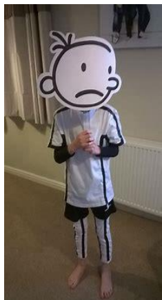
Greg- Diary of a Wimpy Kid