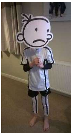
Greg- Diary of a Wimpy Kid