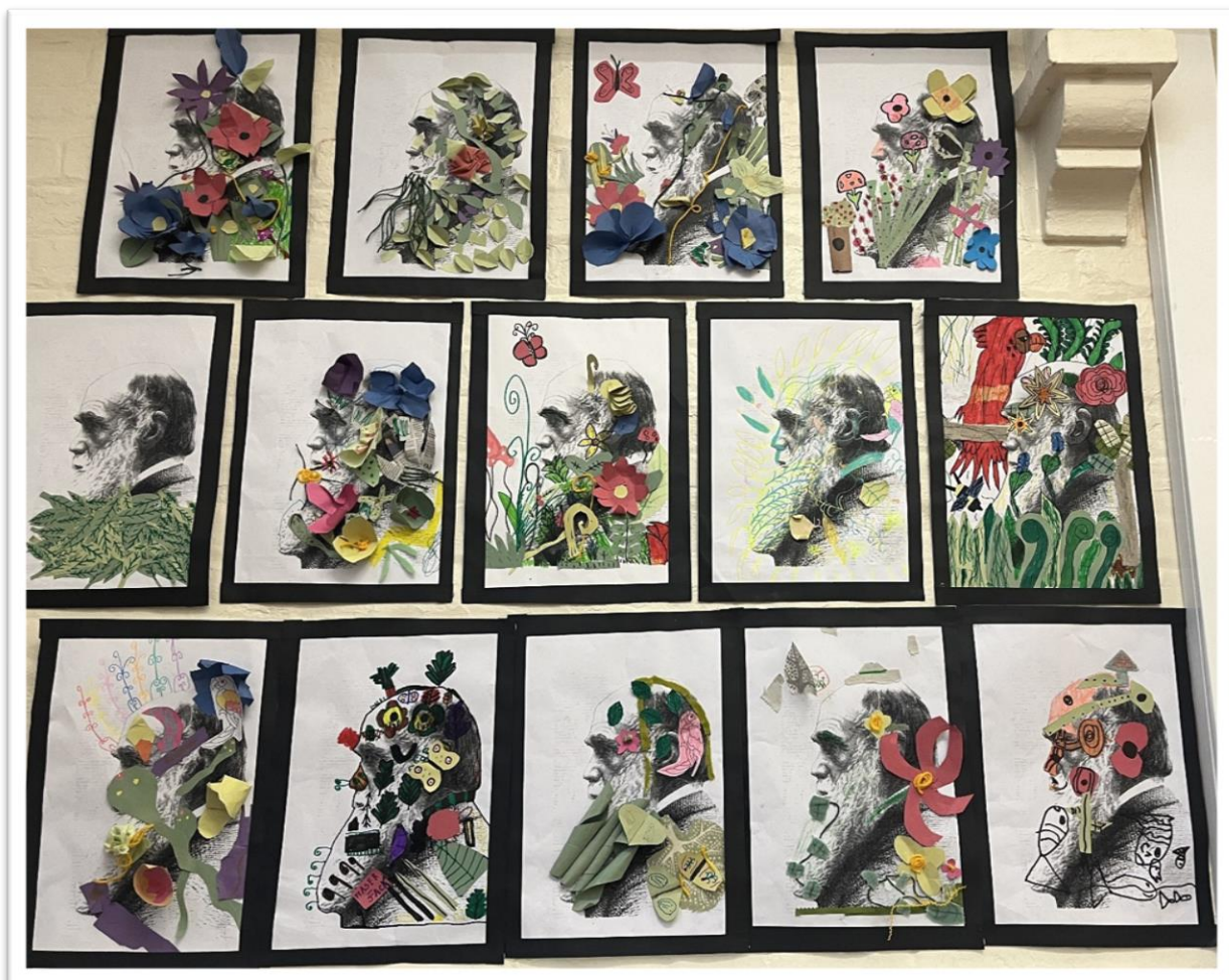
Children from Kestrels – can you spot your creation?