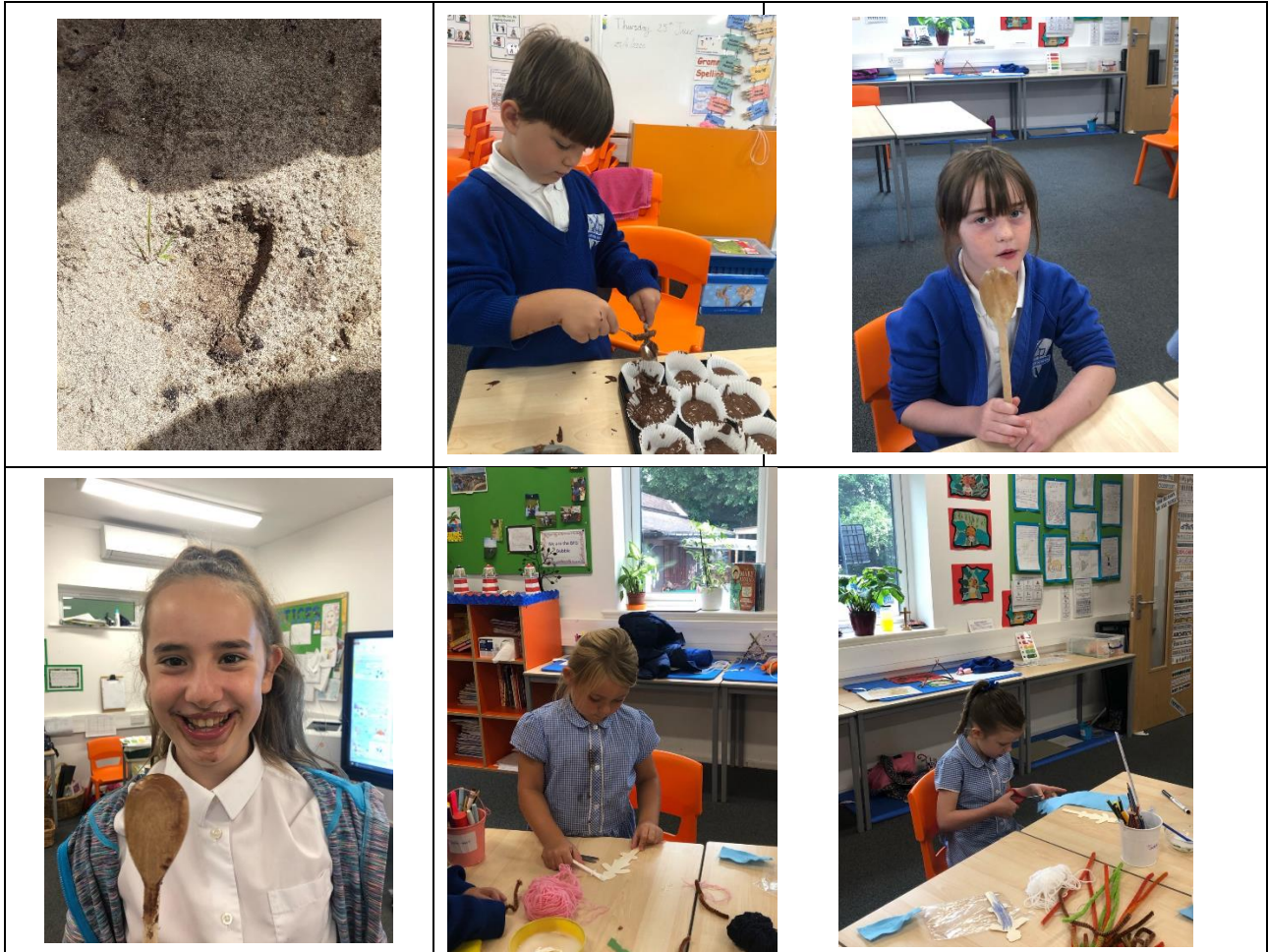
Wow, haven't they been busy! Chocolate cake, bubbles, tortilla making, finding out about vegetables and riding bikes. Percy the peacock visited the playground and put on a great tail display. The sandy footprint was found during a walk.